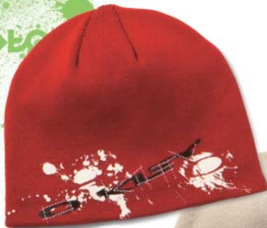
SPLATTER BEANIE $16 DARK RED, CONCRETE IMPORTED