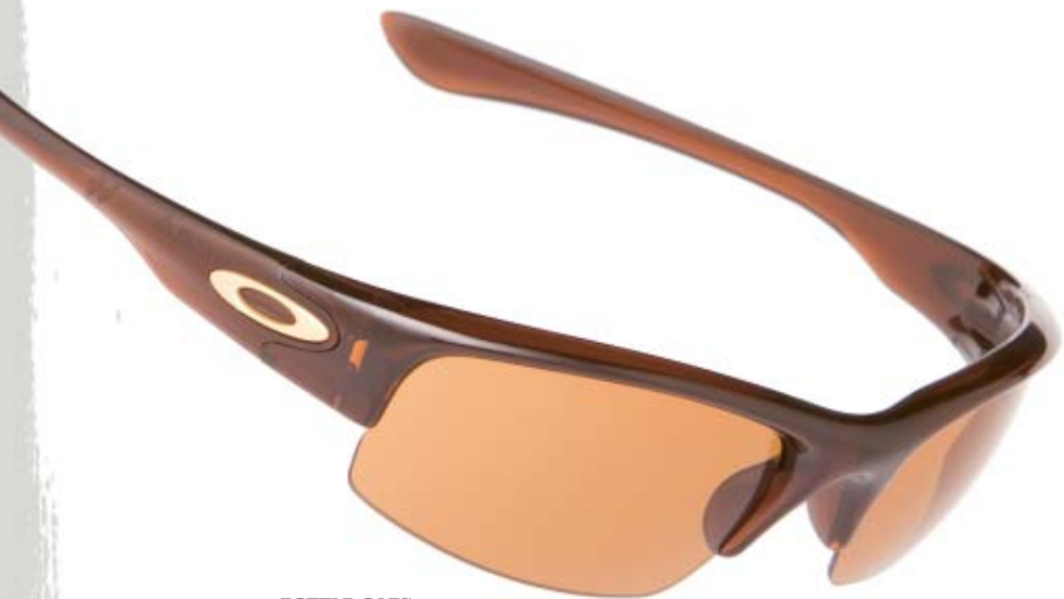
BOTTLE CAP™ $95 POLISHED ROOTBEER/BRONZE