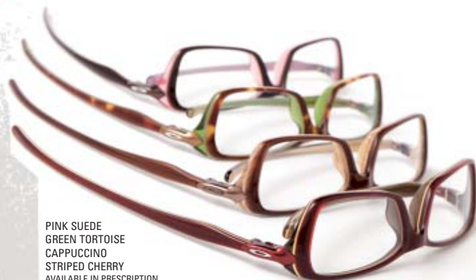
PINK SUEDE GREEN TORTOISE CAPPUCCINO STRIPED CHERRY AVAILABLE IN PRESCRIPTION