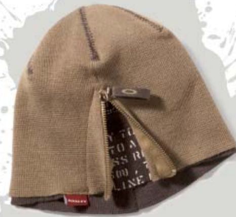
ZIPPER BEANIE $28 KHAKI IMPORTED