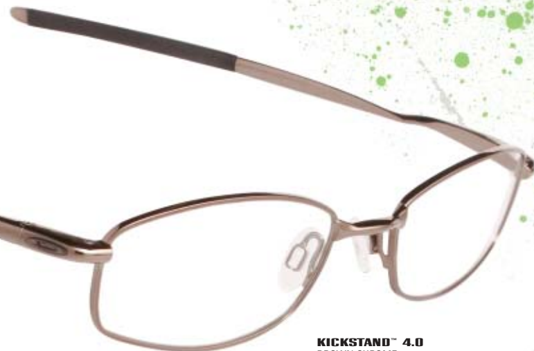
KICKSTAND™ 4.0 BROWN CHROME AVAILABLE IN PRESCRIPTION