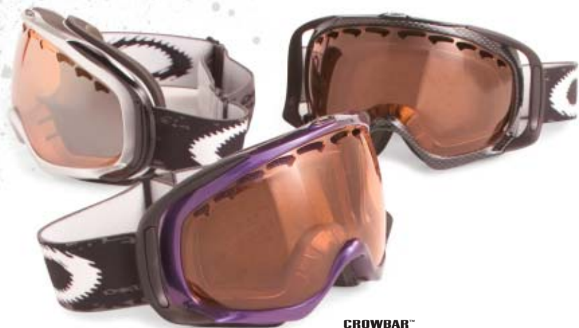
CROWBAR™ METALLIC SILVER/HI PERSIMMON $125 INDIGO/BLACK IRIDIUM $125 CARBON FIBER/PERSIMMON $90