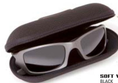
SOFT VAULT BLACK