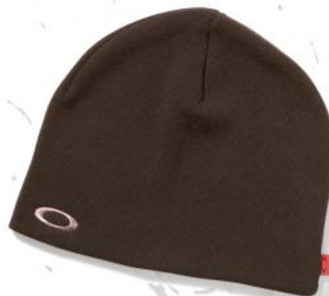
FINE KNIT BEANIE $22 BLACK IMPORTED