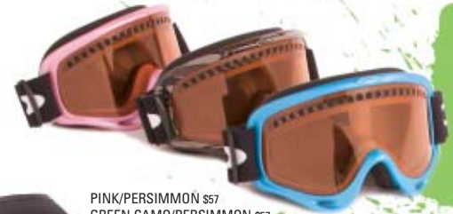
PINK/PERSIMMON $57 GREEN CAMO/PERSIMMON $57 POWDER/PERSIMMON $57