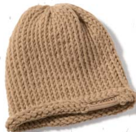
HAND KNIT BEANIE $22 KHAKI IMPORTED