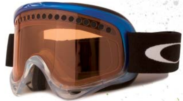
O FRAME® $57 BLUE TO CLEAR FADE/PERSIMMON