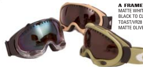
OPPOSITE PAGE A FRAME GOGGLE $85 MATTE OLIVE/VR29