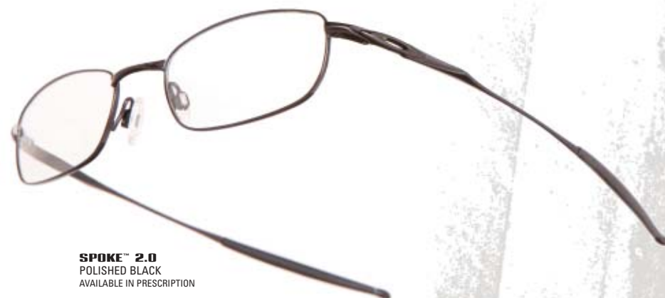
SPOKE™ 2.0 POLISHED BLACK AVAILABLE IN PRESCRIPTION