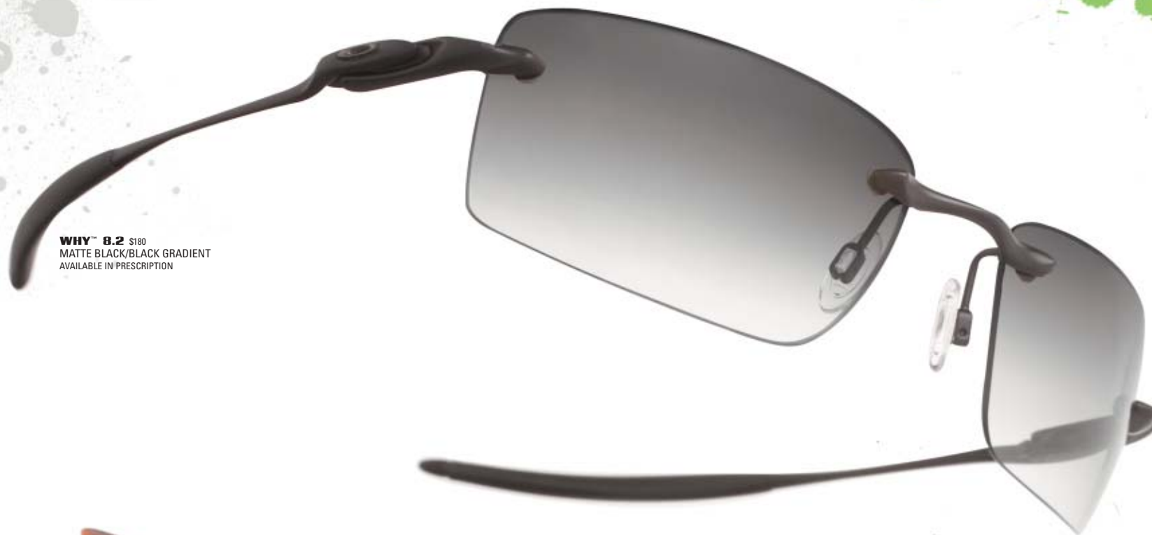
WHY™ 8.2 $180 MATTE BLACK/BLACK GRADIENT AVAILABLE IN PRESCRIPTION