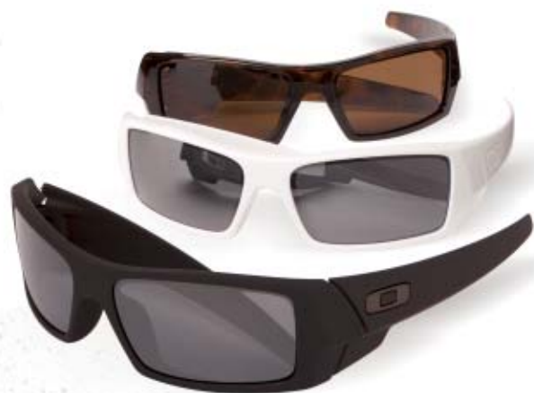
GASCAN™ BROWN TORTOISE/BRONZE POLARIZED $170 POLISHED WHITE/BLACK IRIIDIUM $100 MATTE BLACK/BLACK IRIIDIUM POLARIZED $180