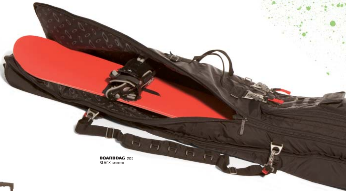
BOARDBAG $220 BLACK IMPORTED