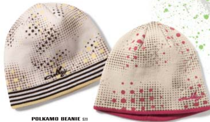
POLKAMO BEANIE $20 WHITE POLKA DOT, CEMENT POLKA DOT IMPORTED