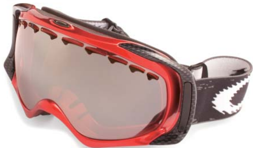
CROWBAR™ $125 METALLIC RED/BLACK IRIDIUM

OPPOSITE PAGE AXEL JACKET $350 WHITE/BLUE CHIP IMPORTED