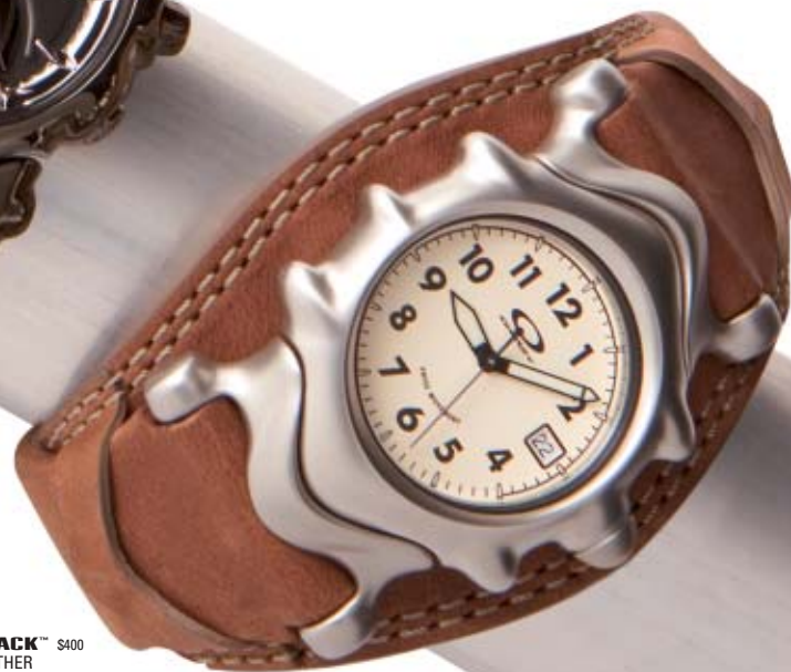
SADDLEBACK™ $400 BROWN LEATHER