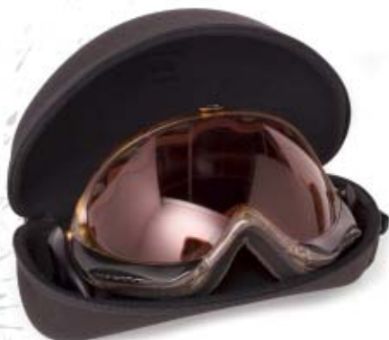
WISDOM GOGGLE CASE $40 BLACK IMPORTED