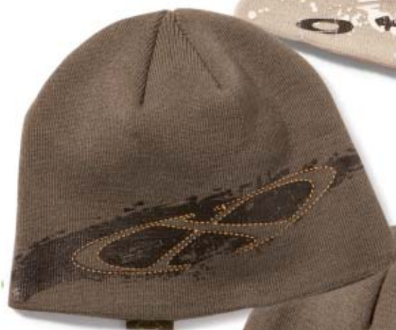
INDUSTRIAL BEANIE $35 SHEET METAL IMPORTED