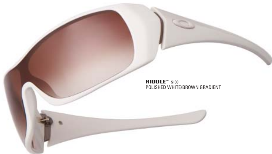
RIDDLE™ $130 POLISHED WHITE/BROWN GRADIENT