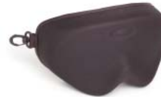
GOGGLE CASE $35 BLACK IMPORTED