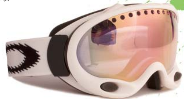
A FRAME® MATTE WHITE/PINK IRIDIUM $120 BLACK TO CLEAR FADE/BLACK IRIDIUM $120 TOAST/VR28 POLARIZED $170 MATTE OLIVE/VR29 $85