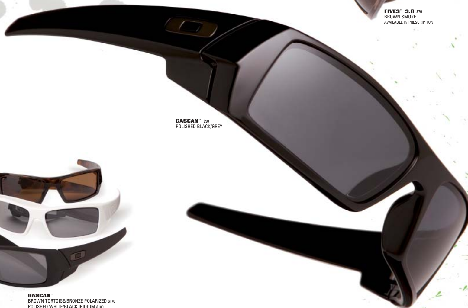
GASCAN™ $90 POLISHED BLACK/GREY