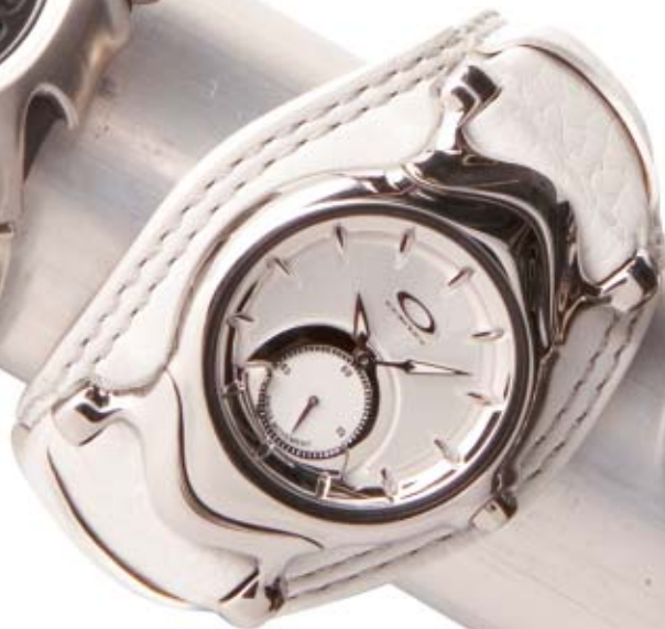
JURY™ $550 WHITE LEATHER