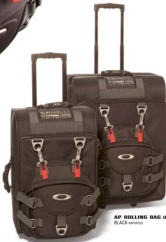
AP ROLLING BAG (SMALL) $240 BLACK IMPORTED