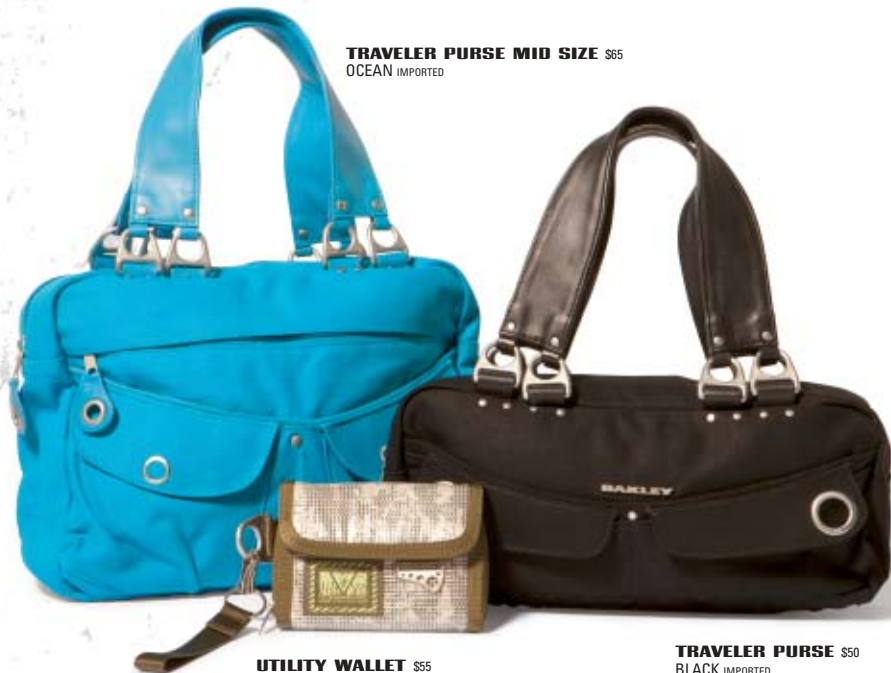
TRAVELER PURSE MID SIZE $65 OCEAN IMPORTED