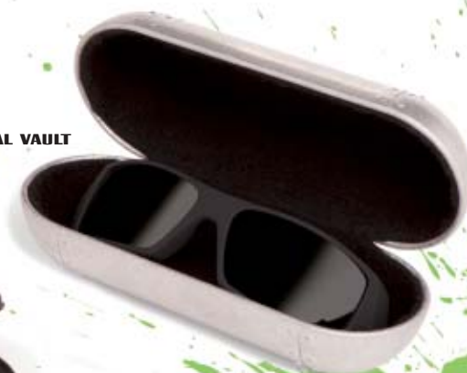
METAL VAULT SILVER