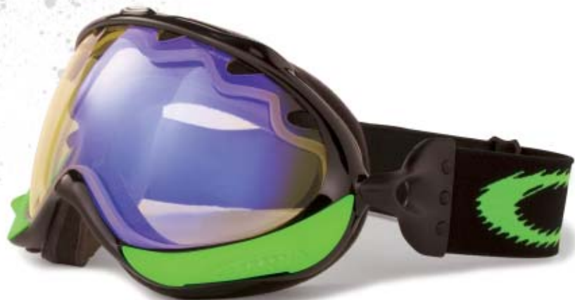
WISDOM™ $130 JET BLACK/NEON GREEN/HI BLUE