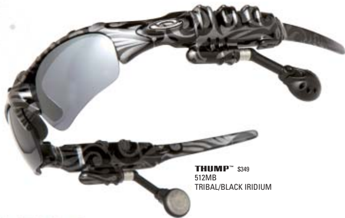
THUMP™ $349 512MB TRIBAL/BLACK IRIDIUM