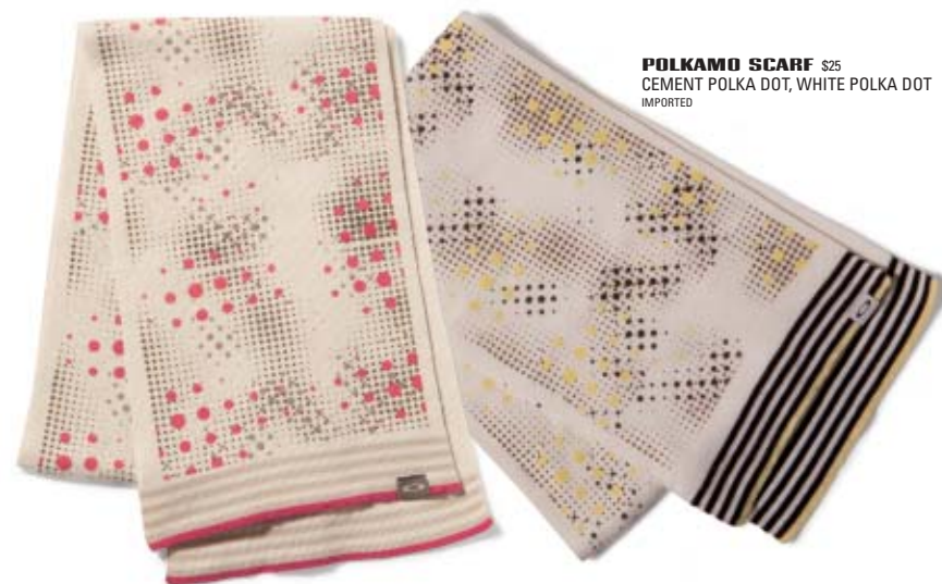
POLKAMO SCARF $25 CEMENT POLKA DOT, WHITE POLKA DOT IMPORTED