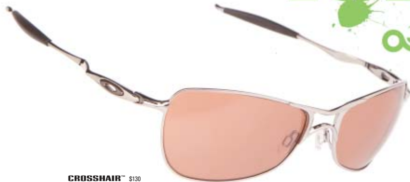
CROSSHAIR™ $130 POLISHED CHROME/VR28 BLACK AVAILABLE IN PRESCRIPTION