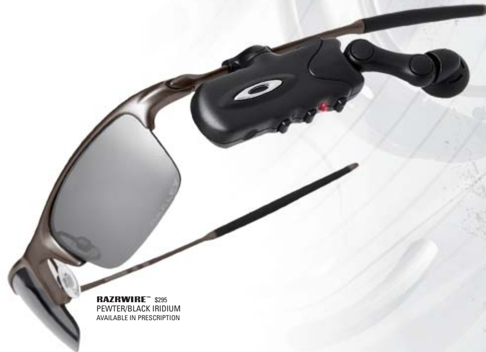
RAZRWIRE™ $295 PEWTER/BLACK IRIDIUM AVAILABLE IN PRESCRIPTION