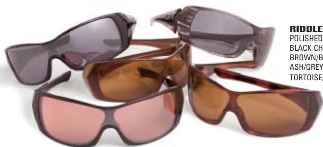
RIDDLE™ POLISHED BLACK/BLACK IRIIDIUM $130 BLACK CHERRY/G30 BLACK IRIIDIUM $130 BROWN/BRONZE $120 ASH/GREY POLARIZED $200 TORTOISE/BRONZE POLARIZED $200

OPPOSITE PAGE RIDDLE™ POLISHED WHITE/BROWN GRADIENT RIOT TUNIC OCEAN