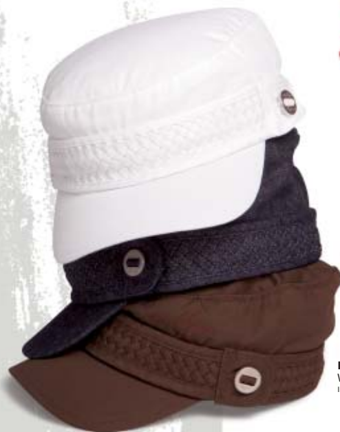
BRAIDED BAND CAP $32 WHITE, DENIM, BROWN IMPORTED