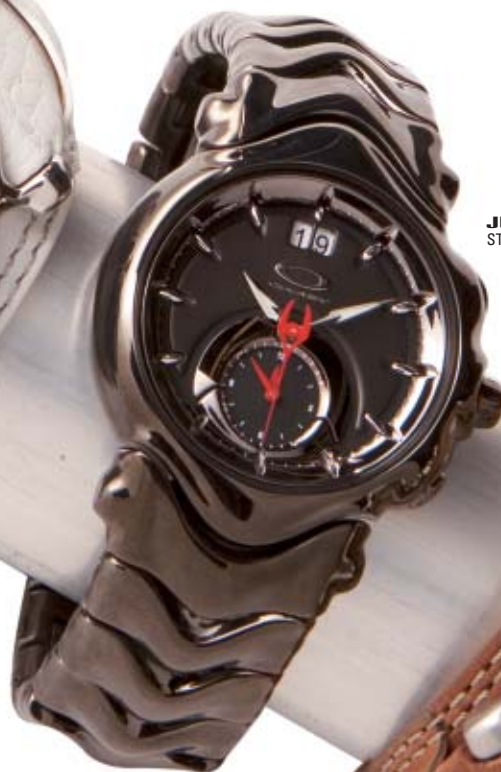
JUDGE™ $650 STEALTH