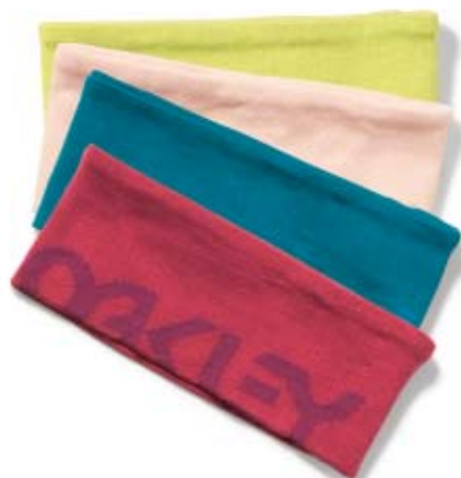
FADE BEANIE $14 ANTI FREEZE, PALE PINK, OCEAN, BERRY IMPORTED