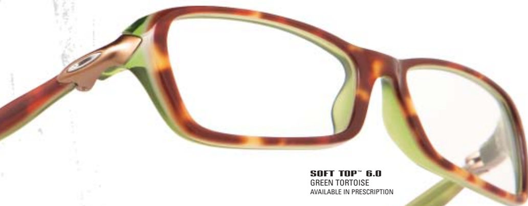
SOFT TOP™ 6.0 GREEN TORTOISE AVAILABLE IN PRESCRIPTION