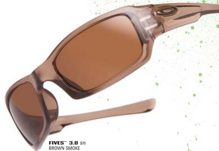
FIVES™ 3.0 $70 BROWN SMOKE AVAILABLE IN PRESCRIPTION