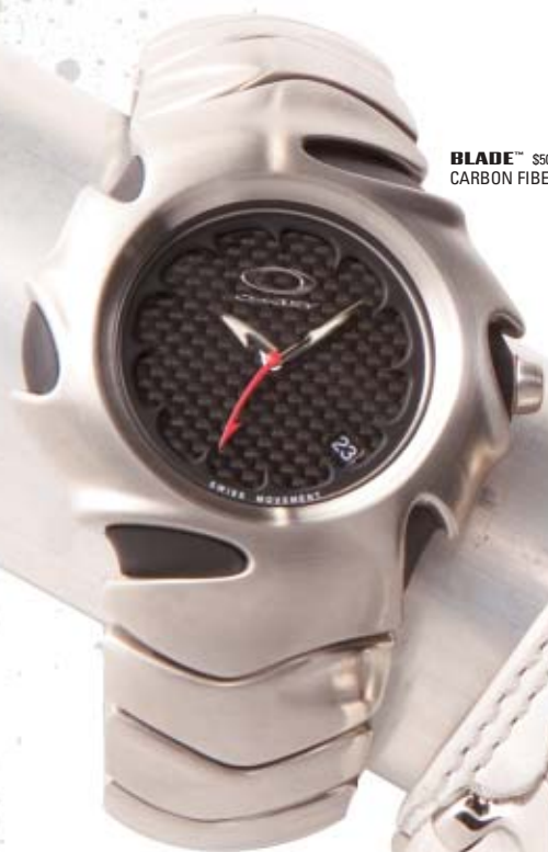
BLADE™ $500 CARBON FIBER