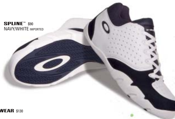
SPLINE™ $90 NAVY/WHITE IMPORTED