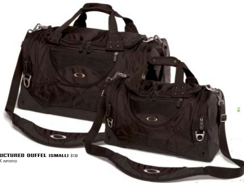
STRUCTURED DUFFEL (SMALL) $130 BLACK IMPORTED