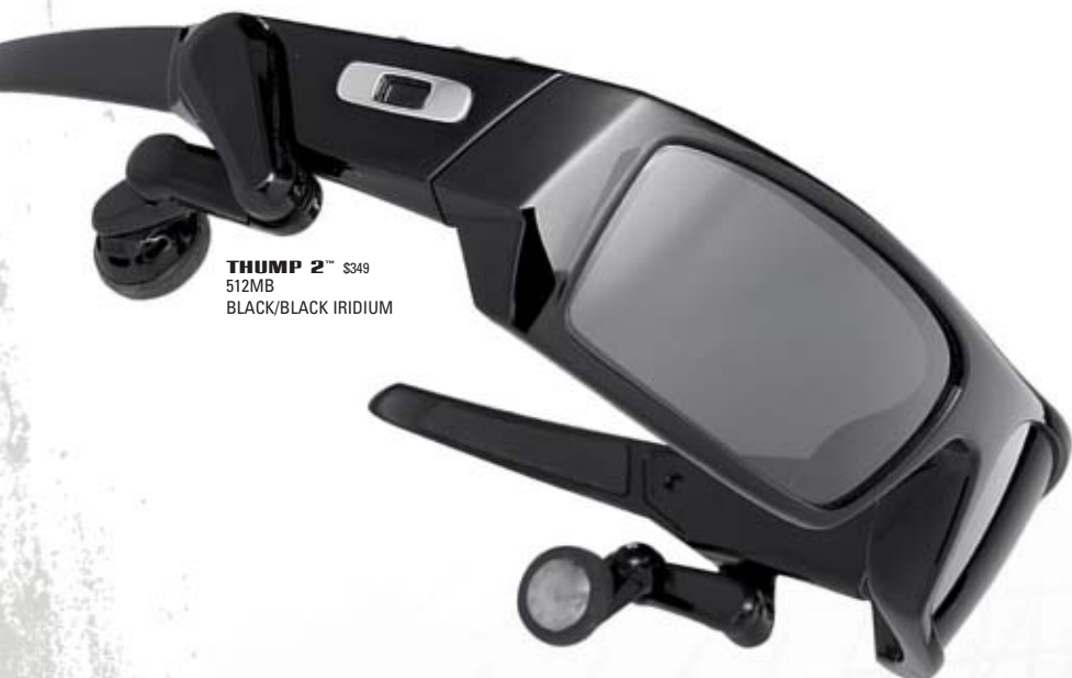
THUMP 2™ $349 512MB BLACK/BLACK IRIDIUM

Imagine an entire music system built into something you're already wearing. No more cords to dangle and tangle. Just the freedom to listen to songs anytime, anywhere, without carrying an extra accessory. Oakley THUMP is the world's first digital music eyewear. Available in two versions, it offers up to one gigabyte of memory. That's 240 of your favorite songs in an eyewear frame with a built-in 75MHz Digital Signal Processor. You also get patented optical clarity, 100% UV filtering, and adjustable speakers that move out of the way when the world has the impudence to interrupt your bliss. Visit oakley.com/thump to find out more.