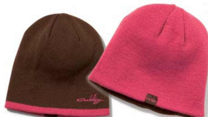
REVERSIBLE ROLLED BEANIE $20 DARK BROWN, BERRY IMPORTED