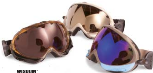
WISDOM™ WHISKEY/GOLD IRIDIUM $130 MATTE WHITE/WHITE/BLACK IRIDIUM $130 TOAST/BLUE/BLUE IRIDIUM $130