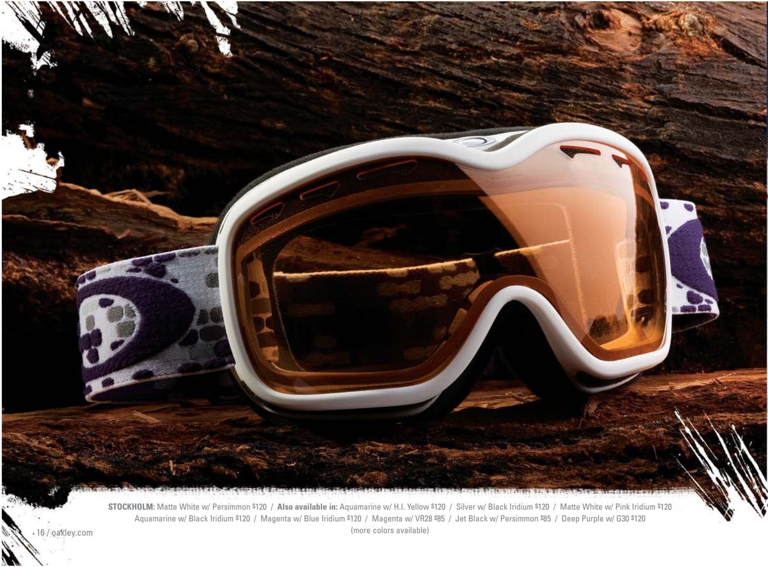
STOCKHOLM: Matte White w/ Persimmon $120 / Also available in: Aquamarine w/ H.I. Yellow $120 / Silver w/ Black Iridium $120 / Matte White w/ Pink Iridium $120 Aquamarine w/ Black Iridium $120 / Magenta w/ Blue Iridium $120 / Magenta w/ VR28 $85 / Jet Black w/ Persimmon $85 / Deep Purple w/ G30 $120 (more colors available)