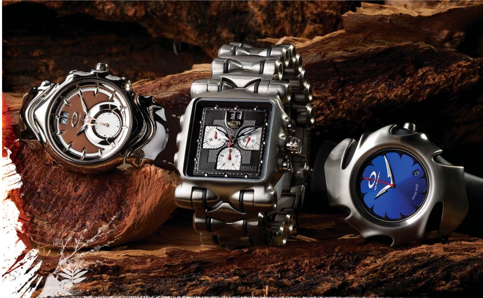
(L to R): JUDGE™ LEATHER STRAP EDITION Polished/Brown in Brown Leather $600 Also available in: Honed/Black in Black Leather $600 OAKLEY TIME TANK™ Titanium Case/Black Dial $1,195 Also available in: Titanium Case/Silver Dial $1,195 / BLADE™ II UNOBTANIUM STRAP EDITION Orbital Brushed/Sunburst Blue Dial $450 Also available in: Orbital Brushed/Sunburst Red Dial, Orbital Brushed/Carbon Fiber, Stealth Black/Black Dial $450