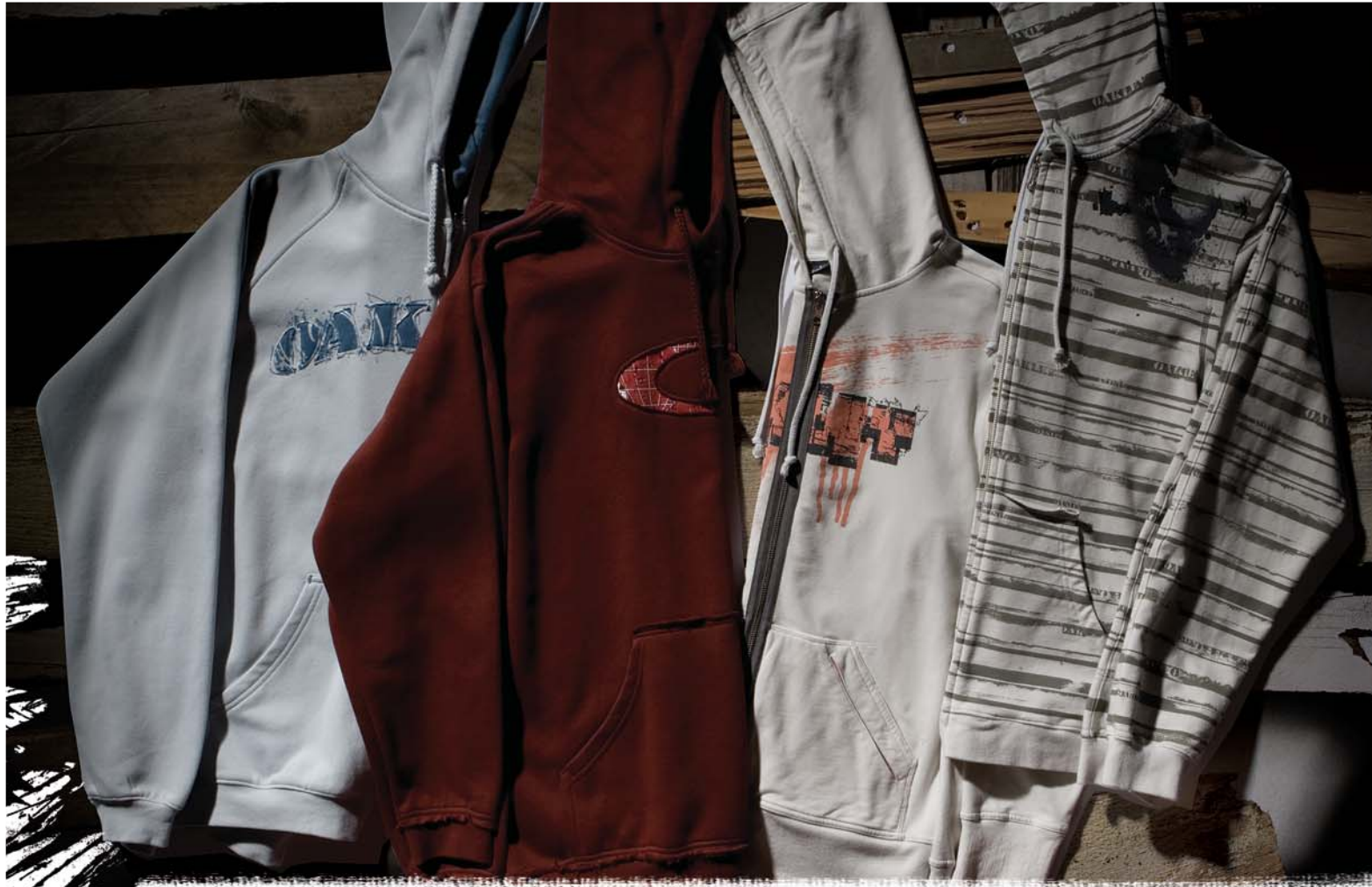
(L to R): Arch Stencil Hood (Illusion Blue) $55 / O Cut Out (Brick Red) $55 / Atiled Reversible Hood (Cement) $60 / Pirate Hood (Cement) $60 (more colors available)