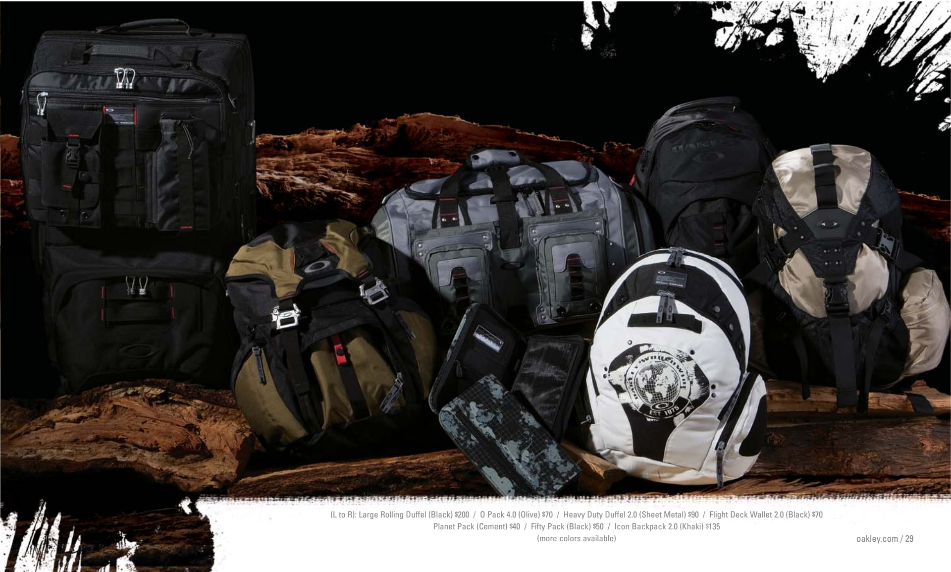
(L to R): Large Rolling Duffel (Black) $200 / O Pack 4.0 (Olive) $70 / Heavy Duty Duffel 2.0 (Sheet Metal) $90 / Flight Deck Wallet 2.0 (Black) $70 Planet Pack (Cement) $40 / Fifty Pack (Black) $50 / Icon Backpack 2.0 (Khaki) $135 (more colors available)