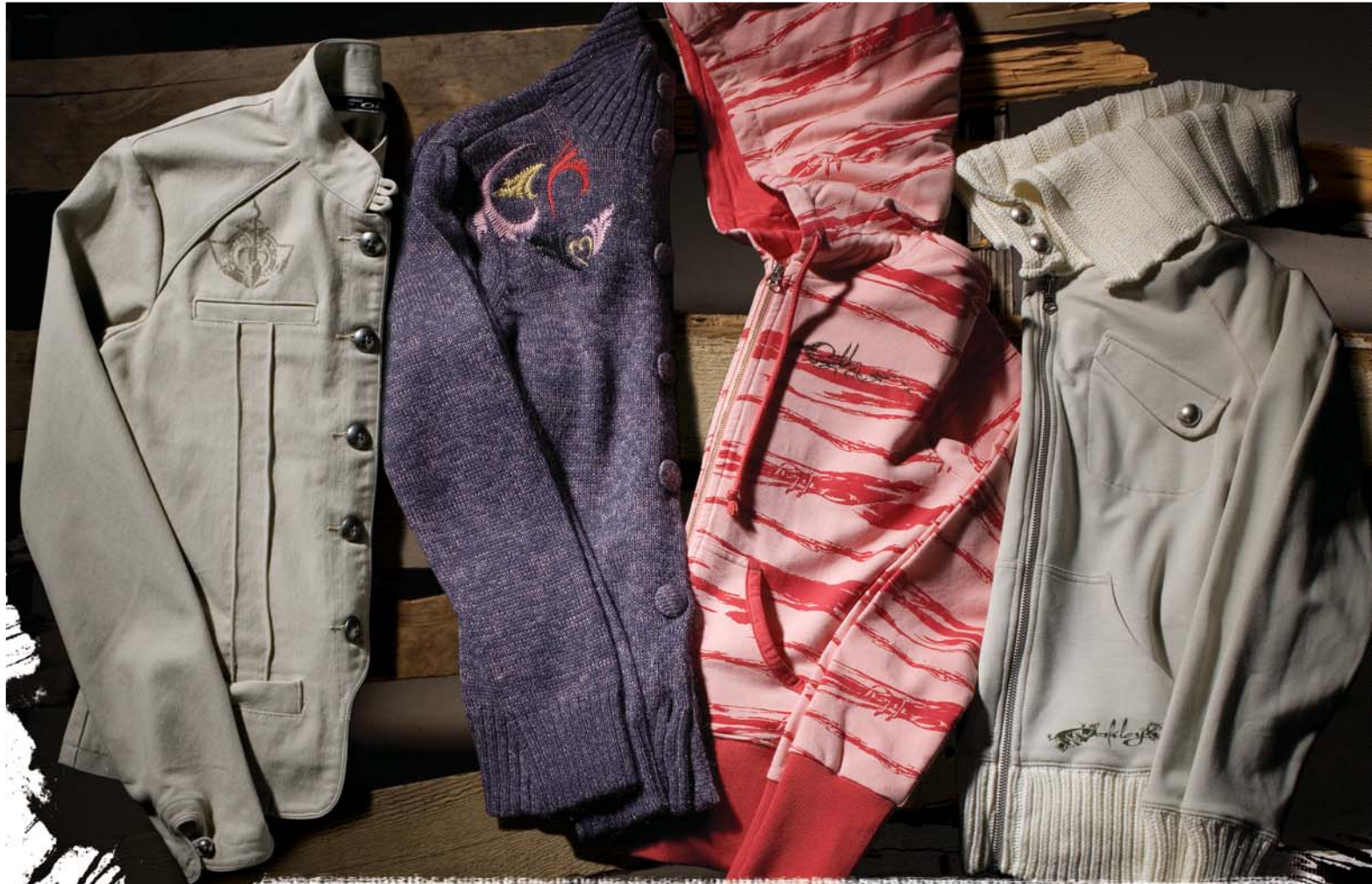
(L to R): Commander Jacket (Fawn Gray) $90 / Together Sweater (Deep Purple) $70 / Yarned Hood (Salmon) $55 / Passport Jacket (Linen) $70 (more colors available)