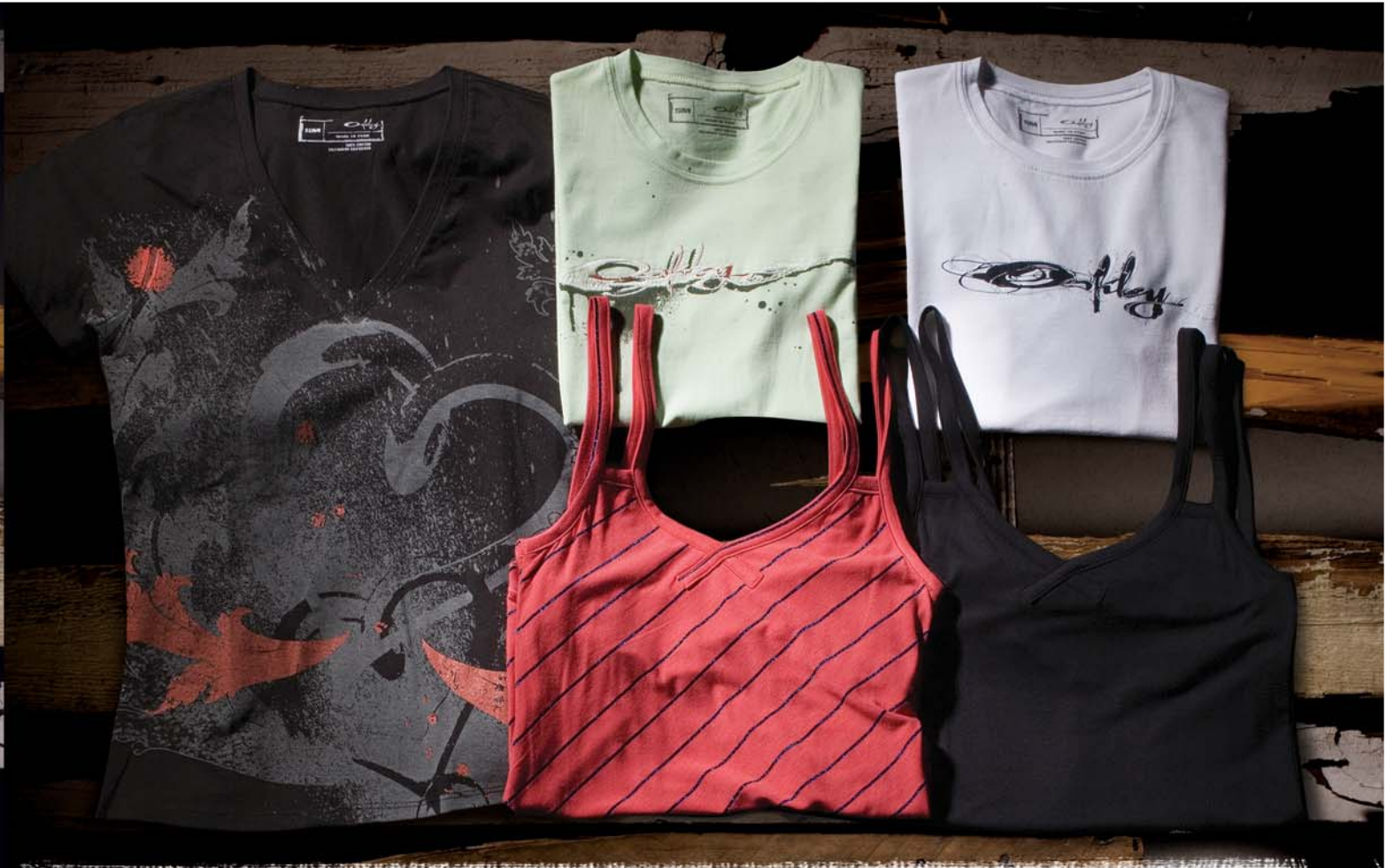
LEFT PAGE: (L to R): Skull Heart L/S (Black) $28 / Bird Cage L/S (Ultra Marine) $45 / Yarned L/S (Salmon) $30 / Bird of Prey L/S (Sheet Metal) $50 RIGHT PAGE: (L to R): Exploding Heart S/S (Black) $24 / Painted Splatter S/S (Mint) $24 / Script Stitched S/S (White) $24 (L to R): Compass Tank (Lipstick) $28 / Compass Tank (Black) $28 (more colors available)