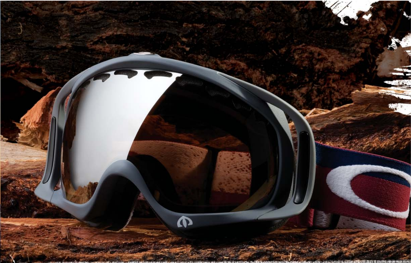
CROWBAR: Terje Haakonsen Signature, VR28 Black Iridium w/ Black Iridium $135 / Also available in: Matte White w/ H.I. Yellow $125 / Harvest Gold w/ Persimmon $90 (more colors available)