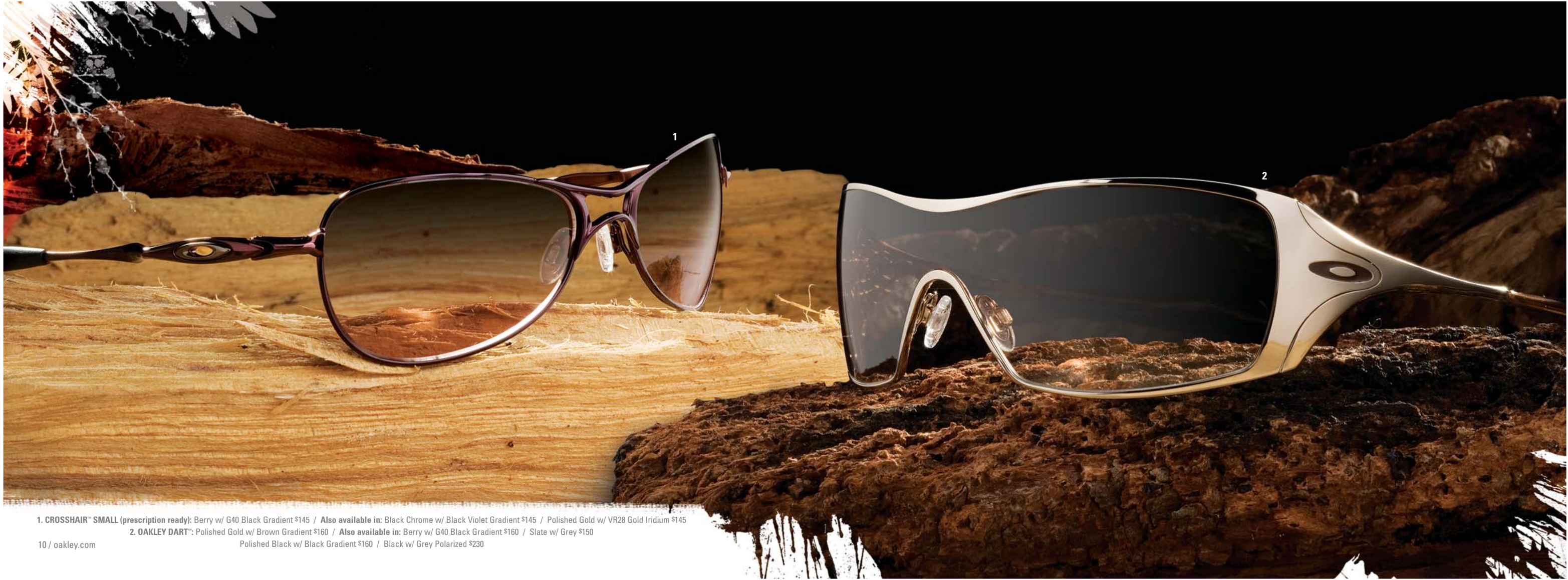
1. CROSSHAIR™ SMALL (prescription ready): Berry w/ G40 Black Gradient $145 / Also available in: Black Chrome w/ Black Violet Gradient $145 / Polished Gold w/ VR28 Gold Iridium $145 2. OAKLEY DART™ : Polished Gold w/ Brown Gradient $160 / Also available in: Berry w/ G40 Black Gradient $160 / Slate w/ Grey $150 Polished Black w/ Black Gradient $160 / Black w/ Grey Polarized $230