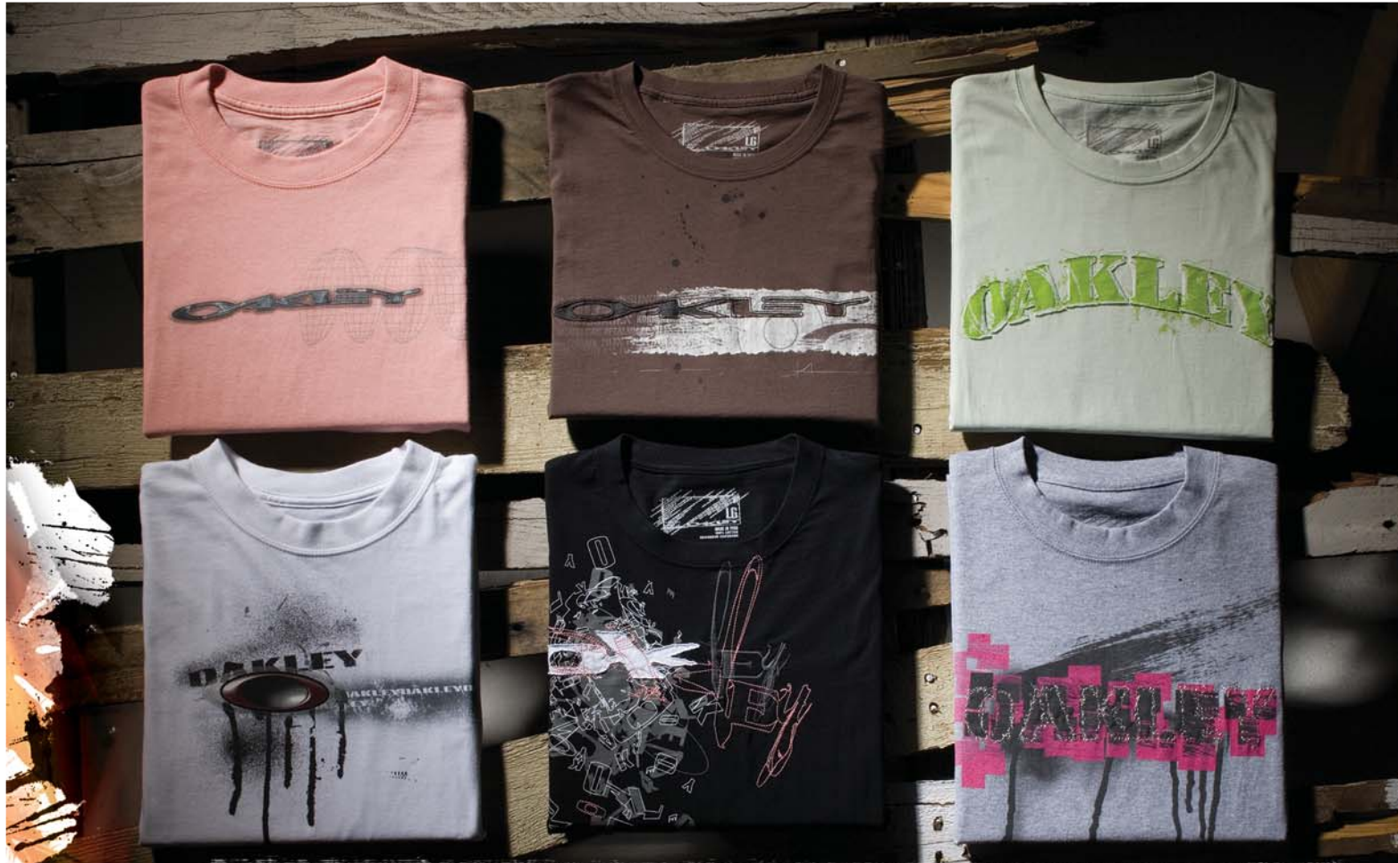
LEFT PAGE: (L to R): Atlas Camo (Salmon) / Target (Earth Brown) / Arch Stencil (Mint) (L to R): Chromed Icon (White) / Fall Out (Black) / Tiled Skull (Heather Grey) / Available in short and long sleeve: $20 - $28 RIGHT PAGE: (L to R): Mileage L/S (Mint) $65 / O Line L/S (White) $65 (more colors available)