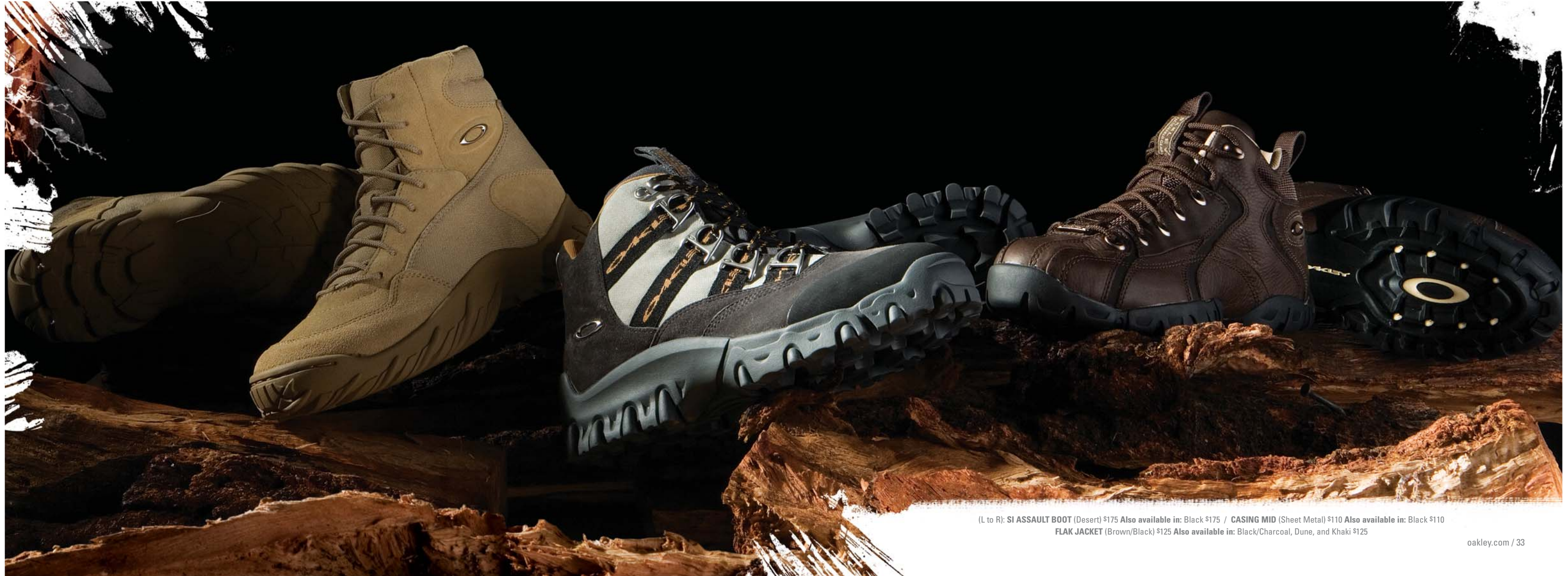
(L to R): SI ASSAULT BOOT (Desert) $175 Also available in: Black $175 / CASING MID (Sheet Metal) $110 Also available in: Black $110 FLAK JACKET (Brown/Black) $125 Also available in: Black/Charcoal, Dune, and Khaki $125