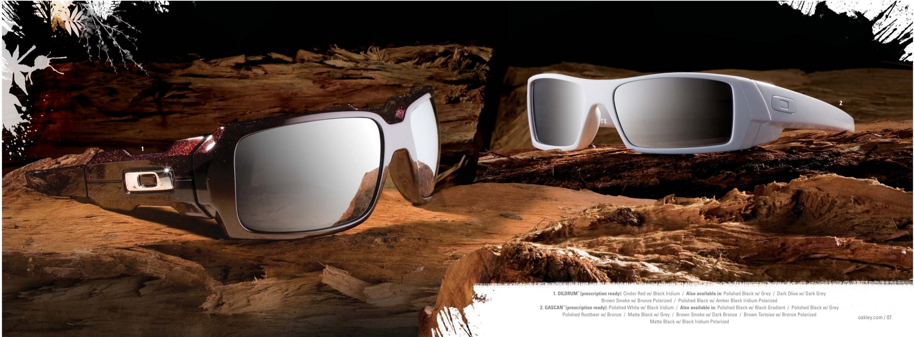
1. OILDRUM™ (prescription ready): Cinder Red w/ Black Iridium / Also available in: Polished Black w/ Grey / Dark Olive w/ Dark Grey Brown Smoke w/ Bronze Polarized / Polished Black w/ Amber Black Iridium Polarized 2. GASCAN™ (prescription ready): Polished White w/ Black Iridium / Also available in: Polished Black w/ Black Gradient / Polished Black w/ Grey Polished Rootbeer w/ Bronze / Matte Black w/ Grey / Brown Smoke w/ Dark Bronze / Brown Tortoise w/ Bronze Polarized Matte Black w/ Black Iridium Polarized