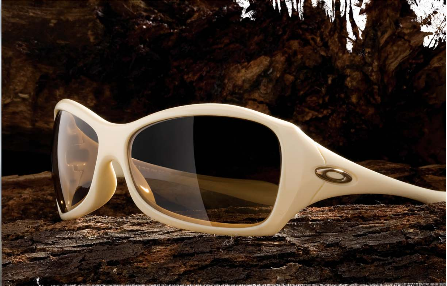
GRAPEVINE (prescription ready): Cream w/ Dark Bronze $120 / Also available in: Rust w/ Brown Gradient $130 / Grape w/ Grey $120 Polished Black w/ Black Gradient $130 / Bottle Green w/ Grey Polarized $175