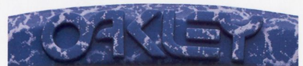
Blue Haze: Pro Frame/O Frame/L Frame