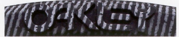
Fingerprint: Pro Frame/O Frame