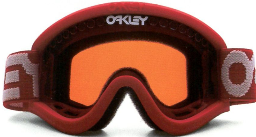
The E Frame with Persimmon single vented lens.

Black Iridium-over-Persimmon for the best all-around lens you can take skiing. Oakley's exclusive Black Iridium reduces glare in bright sunlight while the Persimmon base actually increases contrast and enhances color in flat, overcast light.