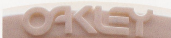
White: E Frame