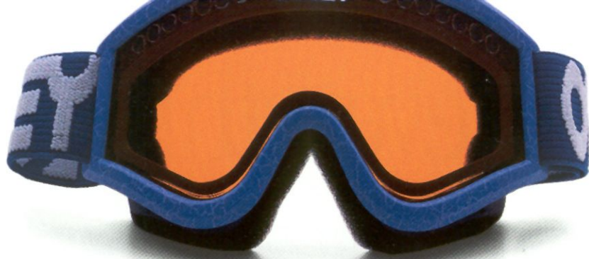
The L Frame, for use over eye glasses, with Persimmon dual vented lens.