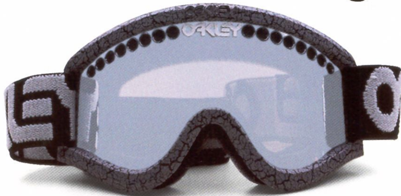
The Pro Frame, with Black Iridium-over-Persimmon dual vented lens.