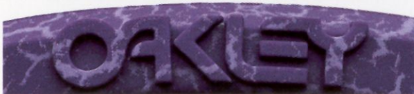
Purple Haze: Pro Frame/O Frame