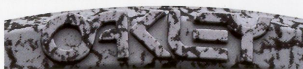
Grey Haze: Pro Frame/O Frame