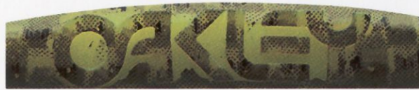
Venom: Pro Frame/O Frame