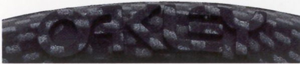
Carbon Fiber: Pro Frame/O Frame/L Frame