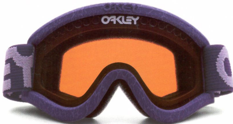
The O Frame with Persimmon dual vented lens.

Blizzards. Sub-zero temperatures. Intense sun. Fog. Flat light. Roasted powder. Even thermonuclear radiation.