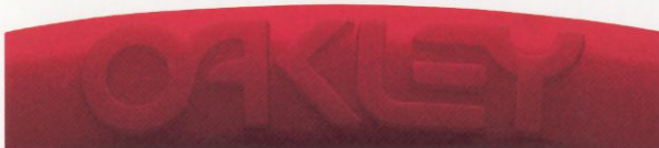
Red: E Frame