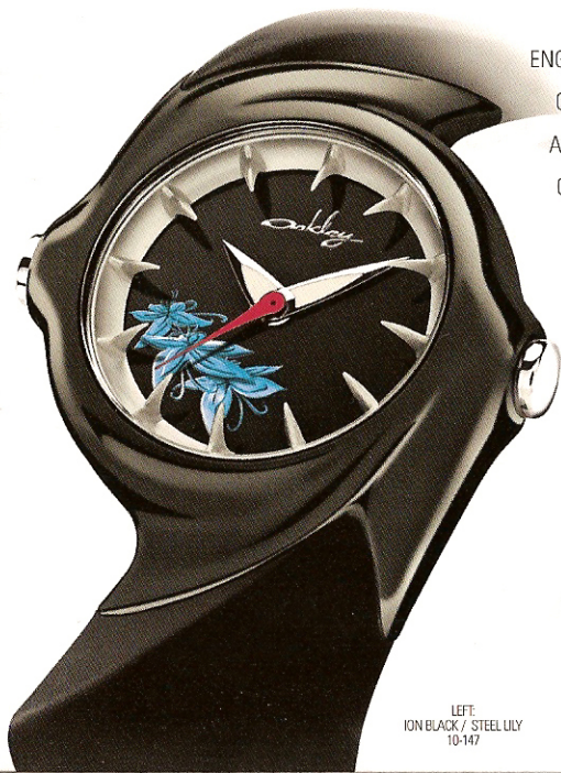
LEFT: ION BLACK / STEEL LILY 10-147

ENGINEERED WITH SMALLER DIMENSIONS THAN CRUSH 2.0, CRUSH 2.5 IS HAND POLISHED FOR A REFLECTIVE LUSTER. AVAILABLE ALSO IN SOFT-BRUSHED METAL, THE CASE CONTOURS BLEND INTO A SOFT UNOBTAINIUM® BAND FOR SUPERIOR FIT AND COMFORT. ONE-JEWEL HIGH PRECISION QUARTZ MOVEMENT IS POWERED BY A FIVE-YEAR BATTERY AND PROTECTED BY A PURE MINERAL GLASS CRYSTAL. A DOUBLE-SEALED CROWN PROTECTS THIS PRECISION INSTRUMENT AGAINST 10-BAR WATER PRESSURE.