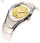
ICON SMALL POLISHED / GOLD 10-052