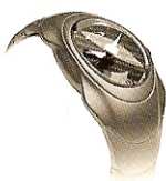
TITANIUM / CARBON FIBER 10-001