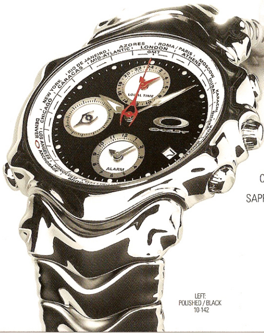
LEFT: POLISHED / BLACK 10-142

DESIGNED FOR WORLD TRAVELERS, GMT FEATURES THE CONVENIENCE OF A WORLD CITY HAND. SET IT TO A LOCATION IN ANY OF THE 24 GLOBAL TIME ZONES FOR LOCAL TIME TO DISPLAY AUTOMATICALLY. DUAL ALARM MODES ARE SET WITH THE EASE OF CONTROLS AND A DEDICATED ALARM DIAL FACE. COMPOSED OF THE HIGHEST GRADE OF SURGICAL STAINLESS STEEL, THE SOLID METAL BAND LINKS ARE ENGINEERED WITH THE ERGONOMICS OF A SPINAL COLUMN FOR THE COMFORT OF A PRECISE FIT. A PURE SAPPHIRE CRYSTAL SEALS THE HIGH-CONTRAST DISPLAY.