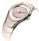
ICON SMALL POLISHED / LAVENDER MOTHER OF PEARL 10-053