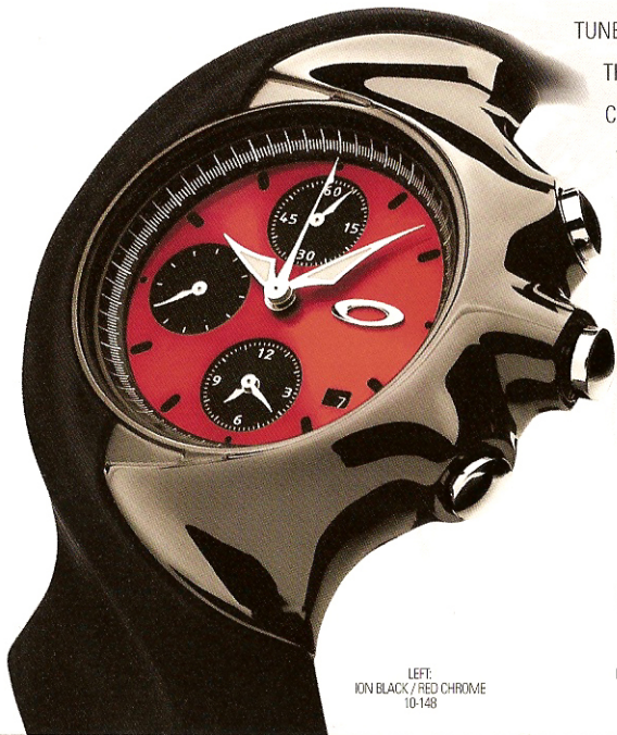
LEFT: ION BLACK / RED CHROME 10-148

TUNED WITH THE ACCURACY OF QUARTZ MOVEMENT, THE SEVEN-HAND DISPLAY FEATURES A PRECISION CHRONOGRAPH. THE INVENTION MEASURES TIME IN 1/5-SECOND INTERVALS TO GAUGE ELAPSED TIME, SPLIT TIME, ACCUMULATED TIME AND DUAL COMPETITOR TIME. INTUITIVE TO OPERATE, THE ALARM INCLUDES ITS OWN SUB DIAL FACE. THE COMFORTABLE BAND OF UNOBTAINIUM® IS SCULPTURALLY BLENDED WITH A DURABLE STAINLESS STEEL CASE, REINFORCED WITH A HIGH STRENGTH INTERNAL 3-D STRUCTURE.