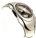
POLISHED TITANIUM / CARBON FIBER 10-008