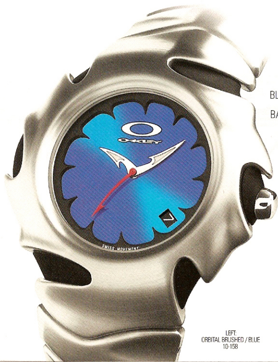
LEFT: ORBITAL BRUSHED / BLUE 10-158

IT TAKES 16 MILLION POUNDS OF FORCE TO HAMMER HIGH-GRADE STAINLESS STEEL INTO SUBMISSION. THE RESULT IS BLADE, A SCULPTURE OF RAZOR CONTOURS BLENDED WITH PURE OAKLEY UNOBTAINIUM®. THE STEEL BAND IS ENGINEERED TO FIT A FULL RANGE OF WRIST SIZES, OFFERING COMFORTABLE FLEXIBILITY. PRECISE FIVE-JEWEL SWISS MOVEMENT IS POWERED WITH THE ENDURANCE OF A 74-MONTH BATTERY. THE HARDEST CRYSTAL UTILIZED IN WATCHMAKING, PURE SAPPHIRE IS ENHANCED WITH ANTI-REFLECTIVE COATING AND SEALED OVER THE INTUITIVE ANALOG DISPLAY.