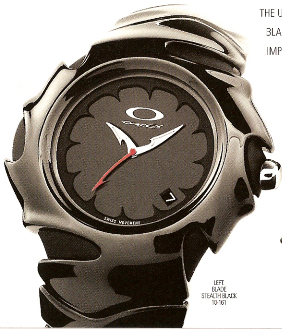
LEFT: BLADE STEALTH BLACK 10-161

THE UPDATED ANALOG FAMILIES INCLUDE A NEW STEALTH BLACK FINISH THAT RENDERS EACH MODEL AS AN IMPOSING BLACK MONOLITH.