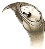
TITANIUM / WHITE 10-002