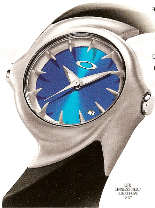
LEFT: STAINLESS STEEL / BLUE CHROME 10-124

FOR UNSURPASSED DURABILITY, A NEARLY INDESTRUCTIBLE BAND IS JOINED TO A STAINLESS STEEL CASE WITH A HIGH-STRENGTH INTERNAL FRAME STRUCTURE. OAKLEY® 4-D™ TECHNOLOGY MAKES IT POSSIBLE BY COMBINING SEPARATE SCULPTURAL FORMS INTO A SINGLE UNIFIED GEOMETRY. ONE-JEWEL HIGH PRECISION QUARTZ MOVEMENT IS PROTECTED BY 10-BAR WATER RESISTANCE. COMFORT AND FIT ARE MAXIMIZED BY UNOBTAINIUM®, A SUPPLE BAND MATERIAL THAT INCREASES GRIP WITH PERSPIRATION.