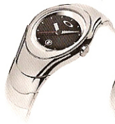
ICON POLISHED / BLACK 10-028

THE MOST LIGHTWEIGHT METAL USED IN WATCHMAKING, TITANIUM IS INJECTION MOLDED TO FORM THE DURABLE CASE AND BAND. O ENGINE® TECHNOLOGY DRIVES AN INERTIAL GENERATOR® TO CONVERT MOVEMENT INTO ELECTRICITY, ELIMINATING THE NEED FOR WINDING OR BATTERIES. SIX-JEWEL QUARTZ MOVEMENT MAINTAINS DEFINITIVE ACCURACY. THE COMFORTABLE FIT IS ACHIEVED WITH COMPUTER NUMERIC CONTROL MACHINING THAT CRAFTS EACH BAND LINK WITH ITS OWN INDIVIDUAL GEOMETRY. ICON SMALL REDUCES THE DIMENSIONS BUT OFFERS THE SAME FEATURES AS THE PREMIER ICON.