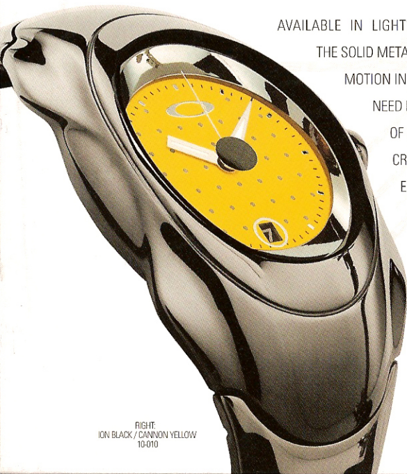
RIGHT: ION BLACK / CANNON YELLOW 10-010

AVAILABLE IN LIGHTWEIGHT TITANIUM OR DURABLE STAINLESS STEEL, THE SOLID METAL CASE HOLDS AN INERTIAL GENERATOR® THAT CONVERTS MOTION INTO ELECTRICITY. 0 ENGINE® TECHNOLOGY ELIMINATES THE NEED FOR WINDING OR BATTERIES. WITH THE DIGITAL ACCURACY OF COMPUTER NUMERIC CONTROL MACHINING, EACH LINK IS CRAFTED WITH POSITIONAL GEOMETRY FOR A COMFORTABLE ERGONOMIC FIT. THE PRECISION OF SIX-JEWEL MOVEMENT IS PROTECTED BY A DOUBLE-SEALED CROWN FOR WATER RESISTANCE DOWN TO 330 FEET.